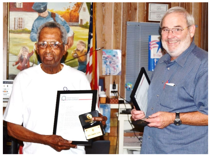
Two past presidents - side by side again